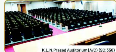
K.L.N.Prasad Auditorium (A/C) (SC:350)