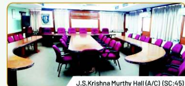
J.S.Krishna Murthy Hall (A/C) (SC:45)