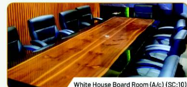
White House Board Room (A/C) (SC:10)