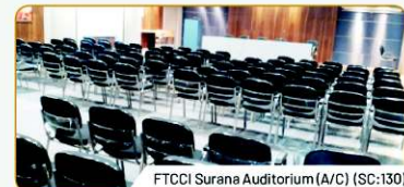
FTCCI Surana Auditorium (A/C) (SC:130)